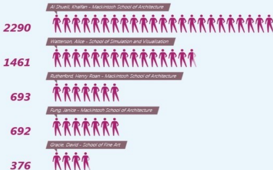
Infographic showing the top five downloaded theses from RADAR